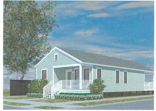
A rendering of the new 3-bedroom, 2-bath design.

We have added a back porch and more depth to front porches so it is easier to physically distance while also remaining in community. We have also added a second bathroom to our standard 3-bedroom build, and we are beginning to offer an even more affordable 2-bedroom option for individuals just starting out.